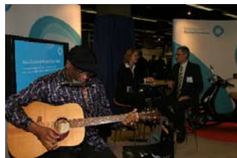
AEMS provided Chicago-style blues during the Taste of Expo.