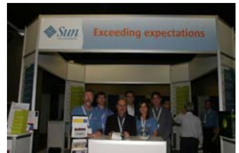
Sun Microsystems reps and partners GE Access, Innovativ and Laurus Technologies