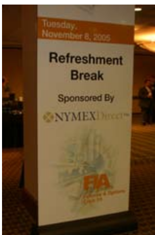
NYMEXDirect refreshment break