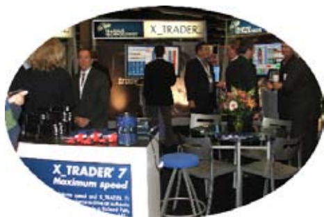
Trading Technologies Booth