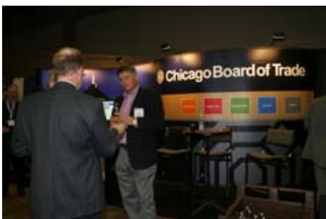
Chicago Board of Trade booth on opening day.