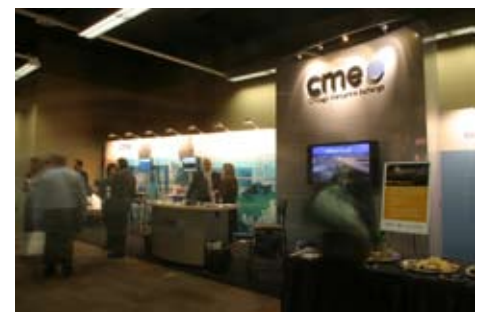
The CME booth bustles during Taste of Expo.