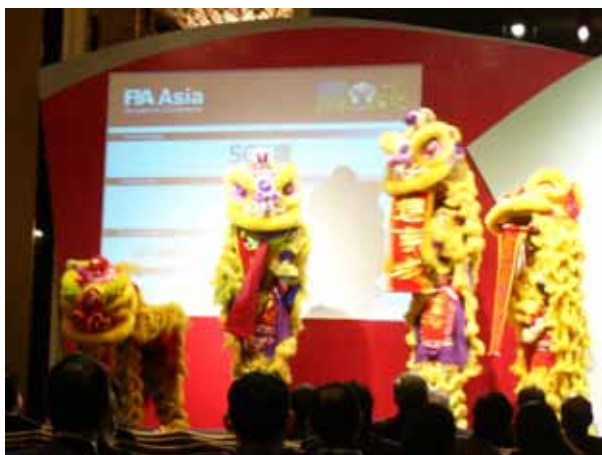
Opening Ceremony: "Year of the Tiger!"

There were over 20 booths from various companies, including three Japanese exchanges: Tokyo Commodity Exchange, Tokyo Financial Exchange and Tokyo Stock Exchange.